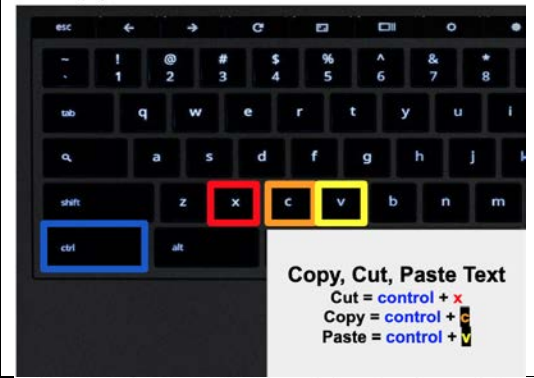
Copy, Cut, Paste Text

To paste what you cut or copied, press control + v.